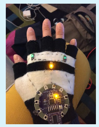
My Final Project

You can <u>crop</u> the edges to make things easier to see (i.e., a close-up).