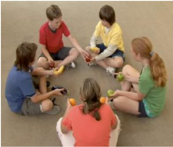
Figure 2.3 Routing fruit (packets).

Pre-publication copy – subject to further editorial correction