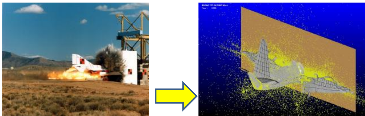
Figure 3.1 Modeling of an airplane crash.

(Left) Image of a crash test measuring the force of impact on an actual F-4 Phantom airplane; image courtesy of Sandia National Labs. (Right) Image of a computational model of the force of impact on an aircraft; image courtesy of Christoph Hoffman, Purdue University.